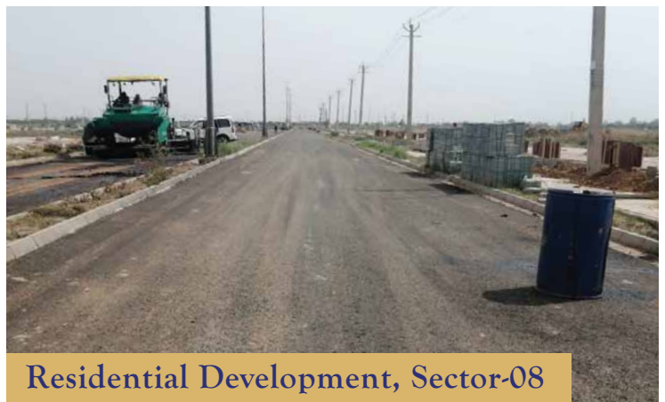
Residential Development, Sector-08