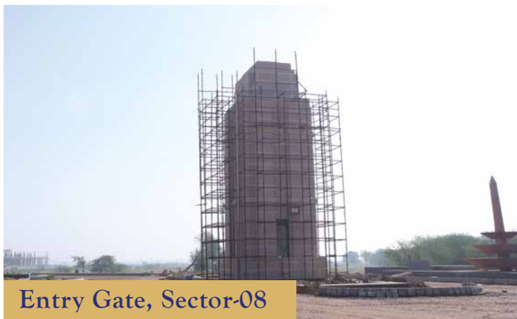
Entry Gate, Sector-08