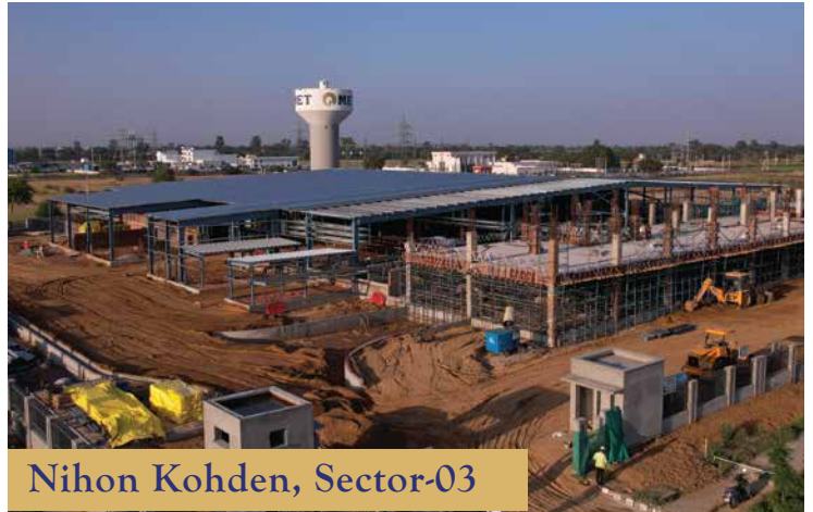
Nihon Kohden, Sector-03