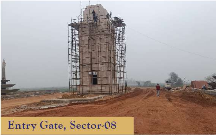
Entry Gate, Sector-08