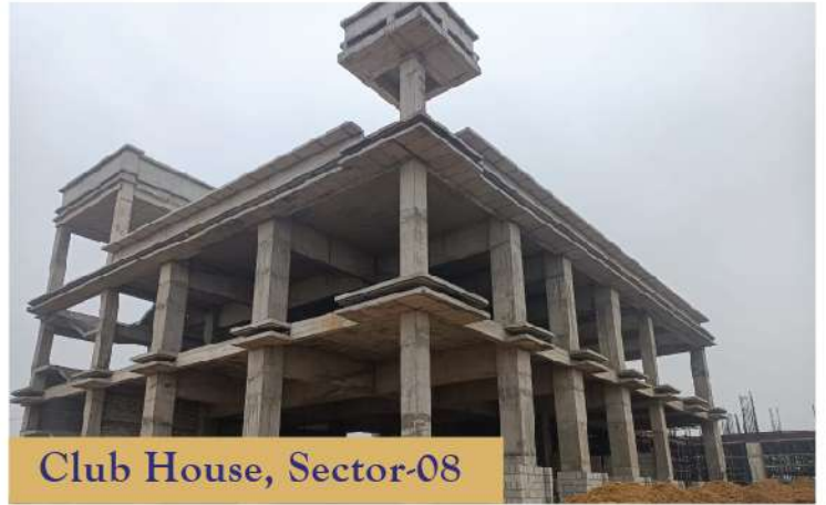
Club House, Sector-08