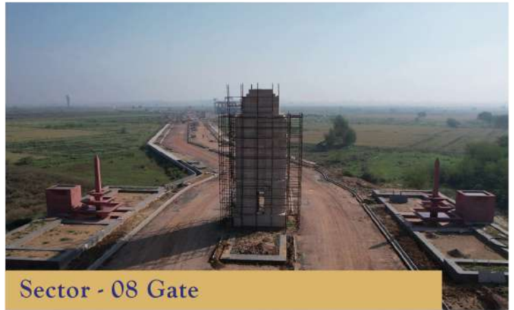
Sector - 08 Gate