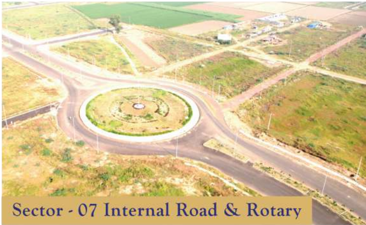
Sector - 07 Internal Road & Rotary