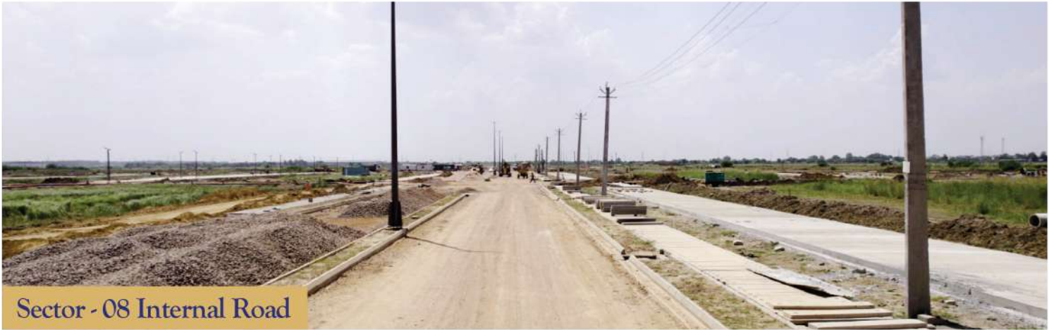
Sector - 08 Internal Road