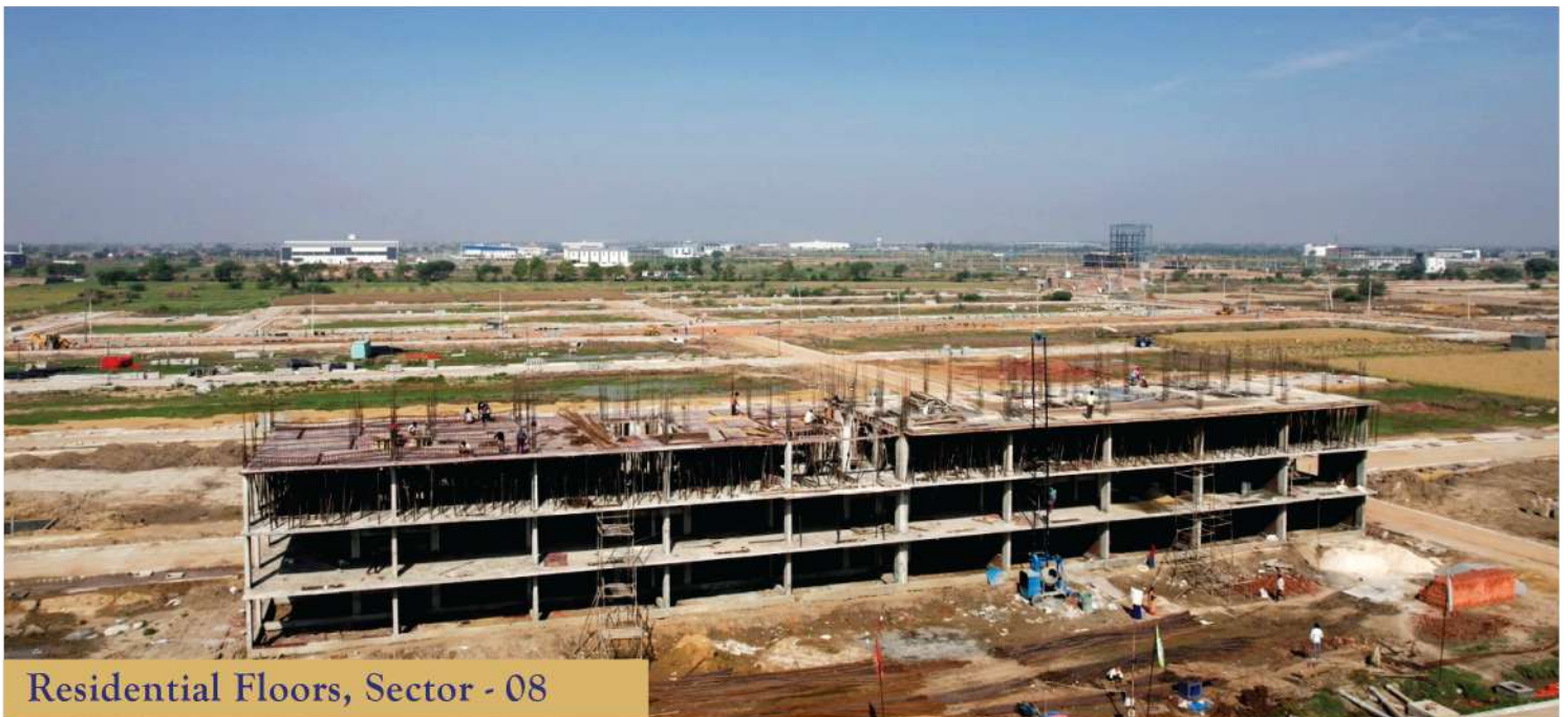
Residential Floors, Sector - 08