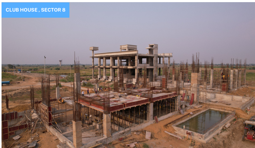
CLUB HOUSE, SECTOR 8