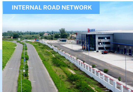
INTERNAL ROAD NETWORK