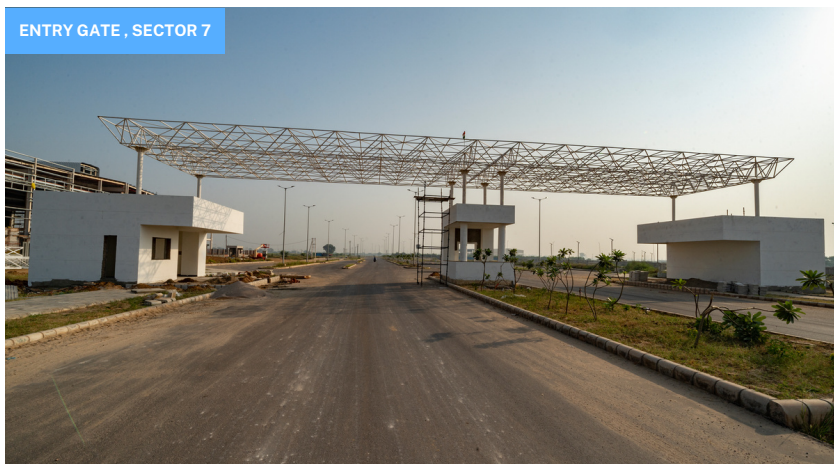
ENTRY GATE, SECTOR 7