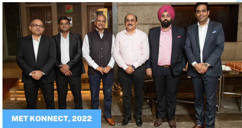
MET KONNECT, 2022