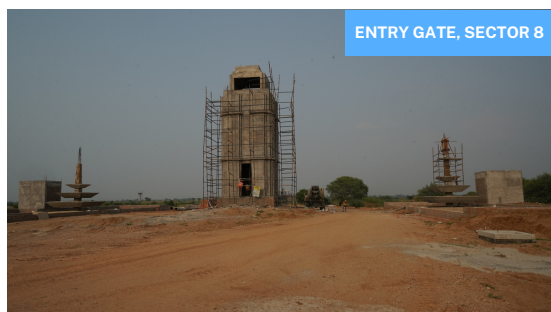
ENTRY GATE, SECTOR 8